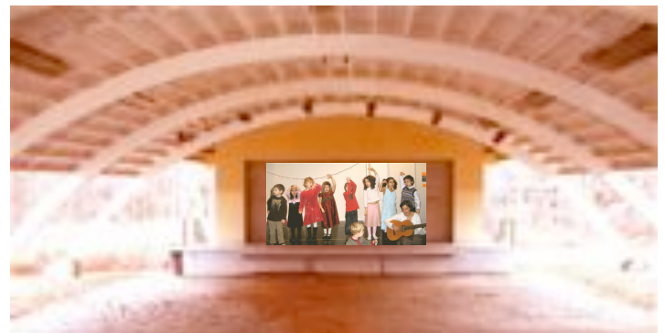
Outdoor amphitheater sets a perfect stage for Garden Road talent

This new and much larger facility will enable us to offer elementary programs through third grade this coming September, with room for us to progressively grow the elementary grades in the coming years.