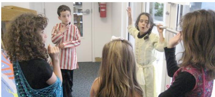
Getting ready for the performance

From learning their lines and how to narrate, to stage directions and blocking, the children got to experience every aspect of putting on a production. The stories, "A Drum" and "The Rough Faced Girl," carried messages of generosity, thankfulness and the importance of having confidence and believing in oneself. Bravo to the Keepers of Respect and Friendship!