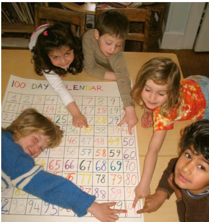
Kittens Co. proudly celebrating 100 days of school

After 100 school days of counting, at last the Kittens Company celebrated the 100th day of school. At the start of the year, the children set a goal to count to 100 days, and when they got there, to have a party. This year, they decided to have a pajama and pizza party with fun games and yummy snacks like 100 chocolate chip cookies.