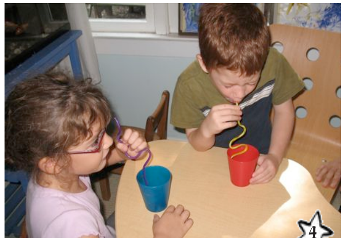
Sippy Straws are more than just fun!

There are a few good reasons for sucking through a crazy straw with your eyes closed. First of all, it helps to improve interhemispheric integration, with the two sides of the brain working better together. Good interhemispheric integration is needed for many important things we do in life, such as processing language, reading, writing and math. Another function it serves is to help the eyes team together. Try the following experiment, and you will be amazed: Get a crazy straw (because they are harder to suck and therefore more effective); hold it in the center of your mouth; CLOSE your eyes and then sip and swallow repeatedly, allowing a rhythmic pattern to develop. Most people actually feel their eyes physically pulling together towards midline while sucking. Amazing! It also helps with light and sound sensitivity, but that's another story. (Note: If it is uncomfortable for any reason to close your eyes while sucking, i.e., your eyes tend to over-converge, then don't close your eyes.)